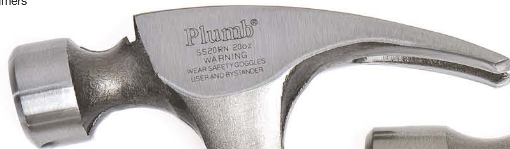
Oversize striking area provides larger "power spot" for faster nailing.