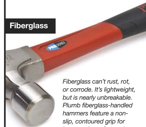
Fiberglass can't rust, rot, or corrode. It's lightweight, but is nearly unbreakable. Plumb fiberglass-handled hammers feature a non-slip, contoured grip for increased comfort and reduced fatigue.