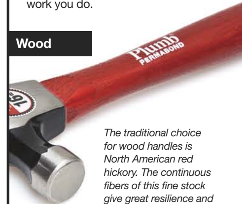
The traditional choice for wood handles is North American red hickory. The continuous fibers of this fine stock give great resilience and strength, while minimizing impact shock.