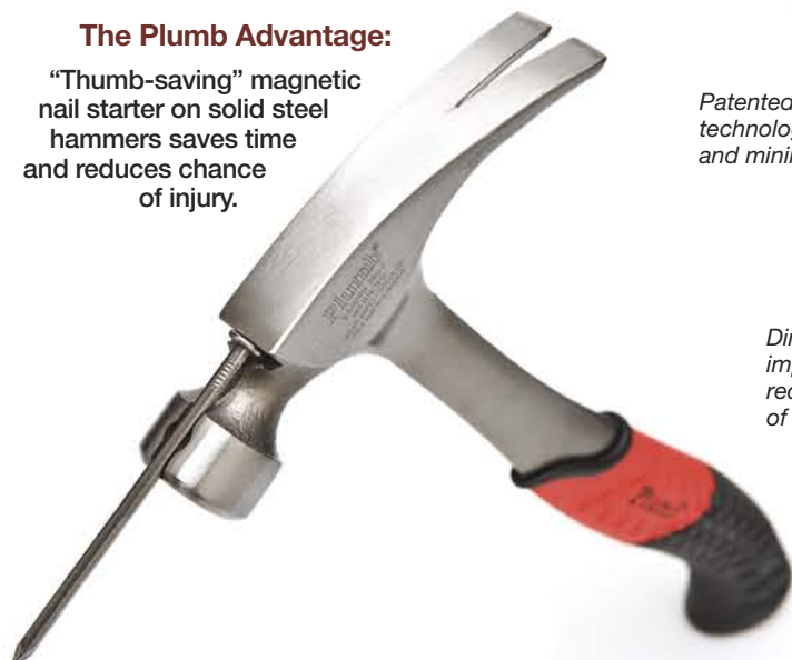
Dimpled grip provides improved control and reduces transmission of vibration.

"Thumb-saving" magnetic nail starter on solid steel hammers saves time and reduces chance of injury.