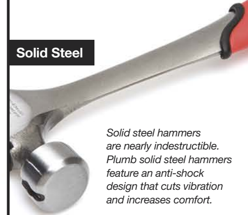
Solid steel hammers are nearly indestructible. Plumb solid steel hammers feature an anti-shock design that cuts vibration and increases comfort.