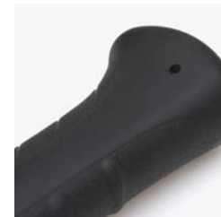
Flared grip end for improved grip and less slippage while striking.